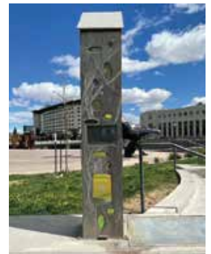
Left, a modern view of City Plaza with two of Reno's remaining historic buildings in the background: the Riverside Hotel, now the Riverside Artists Lofts, and the Downtown Post Office, now 50 S. Virginia. Right, one of the six display posts on the plaza featuring vintage photos and snippets of Reno history.