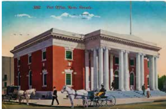
Reno’s 1909 Post Office and Federal Building, facing Virginia Street just north of the Truckee River.

In early August of 1878, fire consumed the Chinese quarter of town. A Chinese firm had recently been awarded a contract to build the 33-mile Steamboat Ditch and the existing disdain for the Chinese was reaching a fever pitch. Coincidentally (or not), an anti-Chinese group had met that same evening to discuss “the Chinese question.” With their homes and possessions suddenly turned to ashes, Alhambra Hall became a short-term home for displaced persons. A local newspaper unsympathetically reported the following on August 17th: In the basement story of the old Alhambra Hall are stowed away from 150 to 200 moon eyes, who live like so many sardines in a box. In the dimly lighted room we see them reclining in every corner, some smoking, a few gambling, others cooking, more eating and all jabbering and gesticulating. The town would not put up with this situation much longer. In early October the following news item appeared: The notice to leave given by the Pavilion Committee to the Chinese who still lingered around the old town, had a decided effect, for not a heathen was left yesterday. It is interesting to go over the vacated places and imagine how like hogs they must have lived.