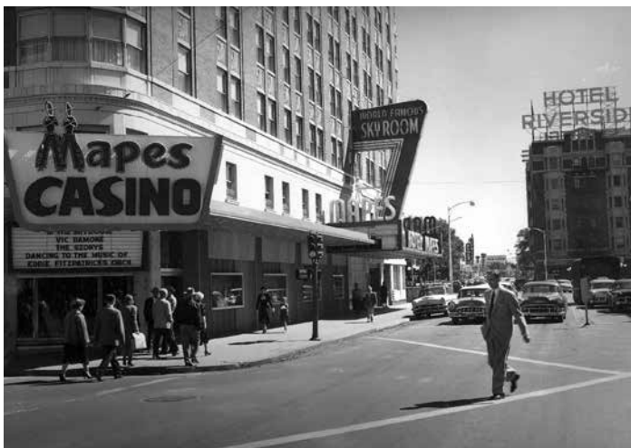
Here you can see the sign with its iconic Mapes cowboys forming the “M” on the Mapes Casino sign. Looking south on Virginia Street, you can see the Mapes’ competitor, the Riverside Hotel.

On October 25, 1945, the NSJ featured a photo captioned “Old Post Office is Doomed.” On December 21st of that year, a headline read “Pillars Crash to Ground as Crowds Watch;” a smaller but no less noteworthy preface to what would occur a little over 55 years later on that same spot. Locals’ fascination with demolition was apparently just as intense then as today. An amusing tongue-in-cheek bit of writing announced: A large delegation of the Sidewalk Watchers Association was present for the final smash—and a goodly number of the crowd had the additional pleasure of being powdered with brick and plaster dust as the last bit of the structure came thundering down.