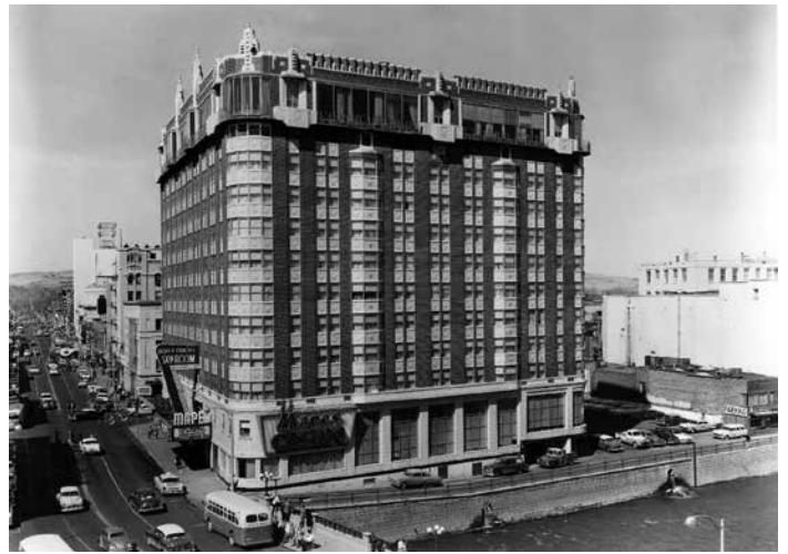
The Mapes Hotel, looking north on Virginia Street. After the windows were installed in 1947, the balconies and delicate railings of the Sky Room were made of aluminum and embedded in concrete.