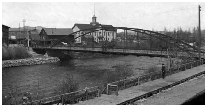
An early view of Reno to the east, across the iron Virginia Street bridge. Alhambra Hall is the dark wooden building to the left of the tall white structure, which was Reno's Army.